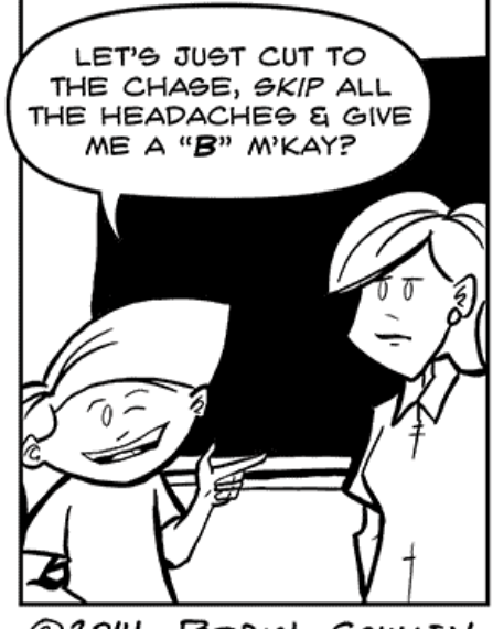
@2014 PATRICK SCULLIN