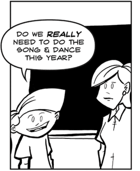
WWW. SUPERSIBLINGS COMICS, COM